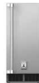
15" Undercounter Ice Machine

DUAL ZONE WINE STORAGE preserves reds and whites with independent temperature zones.