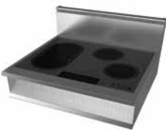
30" Induction Rangetop