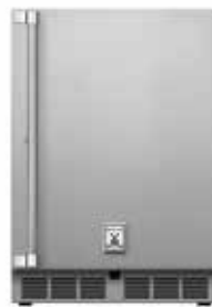
24" Undercounter Refrigerator Glass Door also available