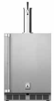
24" Undercounter Single Faucet Beer Dispenser Double Faucet also available