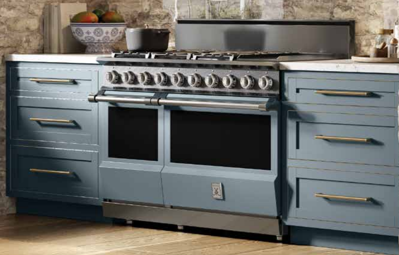
54" Chimney Hood shown in Pacific Fog