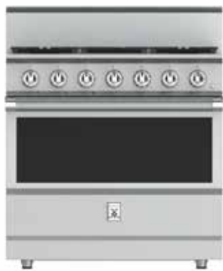
36" All Gas Range 30" and 48" All Gas Ranges also available

SIMMER FLAME CAPABILITY Hestan's precision sealed burner system maintains continuous gentle temperatures without flickering – perfect for delicate sauces.