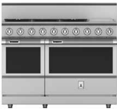
48" Dual Fuel Range 30" and 36" Dual Fuel Ranges also available

PATENTED MARQUISEDISPLAY™ TOUCH CONTROL Digital display and touch controls are elegantly embedded in the range door handle. This industry first delivers exceptional convenience, elegance and chef-friendly control.