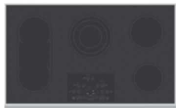
36" Electric Radiant Cooktop 30" Electric Radiant Cooktop also available

SPECTRUM POWER DISPLAY™ The Spectrum Power Display on our radiant cooktops empowers you with instantly intuitive and exceptional control over the premium Trinal™ triple burners.