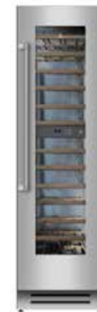
24" Wine Cellar