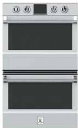
30" Double Wall Oven

SOFT-CLOSE OVEN DOOR The soft-closing oven door with extra-wide glass provides both increased food visibility and heat insulation, along with shock-absorbing, assisted closing to make sure heat stays where it belongs – in the oven.