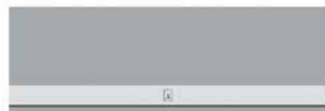
54" Canopy Hood Also in 30", 36", 42" and 48" widths

also delivers best-in-class air-flow efficiency.