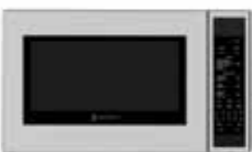
24" Convection Microwave