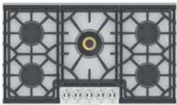
36" Gas Cooktop 30" Gas Cooktop also available

HESTAN'S CIRCUFLAME™ CENTER POWER BURNER delivers up to 30,000 BTUs – so you can go from 0° to crab boil in no time.