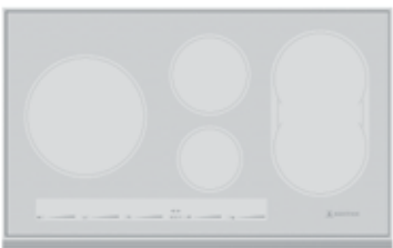
30" and 36" Smart Induction Cooktops