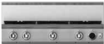
36" Smart Gas Rangetop

SMART INDUCTION COOKING Hestan Smart Cooking Technology is integrated into our Smart Induction Cooktop. When paired with Bluetooth-enabled cookware and the app on your tablet or smartphone, your cooktop becomes a culinary school. Chef-guided videos walk you through each step and technique for hundreds of recipes.