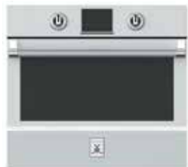
30" Single Wall Oven

Hestan electric products deliver culinary power wherever – and however – your kitchen needs it. Our wall ovens’ TwinVection™ Technology optimizes dual convection fans for perfectly balanced temperature control. Eleven specialized cooking modes ensure triumphant soufflés, standing rib roasts and breads. Speaking of, the convection warming drawer is a wonder at everything from proofing bread to dehydrating foods. Electric Radiant Cooktops marry exceptional power with intuitive control.