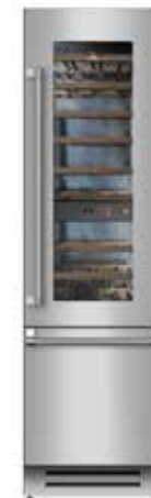
24" Wine Refrigerator