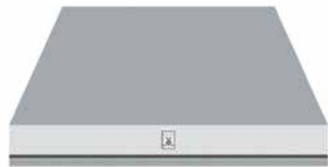
36" Chimney Hood Also in 30", 42", 48" and 54" widths

CIRCUFLOW VENTILATION SYSTEM™ Hestan's breakthrough baffle-less variable-speed blower system collects 70% more grease than almost every other vent hood.