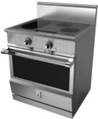
30" Induction Range