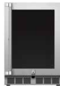
24" Undercounter Dual Zone Refrigerator and Wine Cellar, Solid Door also available