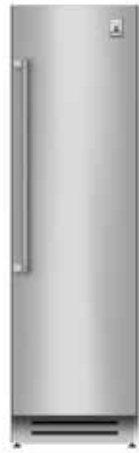
24" Column Refrigerator 30" Column Refrigerator also available