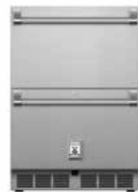
24" Undercounter Refrigerated Drawers Refrigerator and Freezer Drawer also available