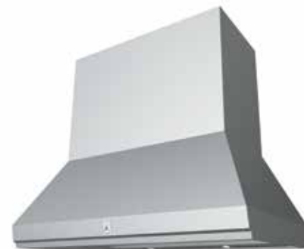
36" Island Hood Also in 42" and 54" widths

CIRCUFLOW VENTILATION SYSTEM™ Hestan's breakthrough baffle-less variable-speed blower system collects 70% more grease than almost every other vent hood.