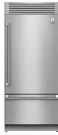
36" Top Compressor Refrigerator

ANTIMICROBIAL EVERCRISP™ DRAWERS AND BINS keep germs and cross-contamination at bay.