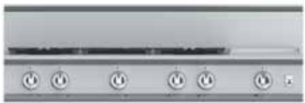
48" Gas Rangetop 30" and 36" Gas Rangetops also available

R ange or wall oven? Cooktop or rangetop? Gas, electric or induction? Hestan performance complements your cooking style – and Hestan's engineers have dialed-in the details so you can dial in your kitchen. The Hestan CircuFlame™ burner delivers the fastest boil time. Custom cast-iron grates create a continuous cooking surface on our ranges and rangetops. TwinVection™ technology in our wall ovens delivers maximum airflow and optimum temperature control.