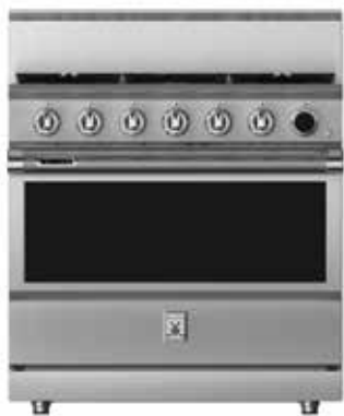
36" Smart Gas Dual Fuel Range

FORGET LO, MED AND HI. Set your flame to a precise temperature with Smart Gas Technology. Your burner will then adjust to maintain the perfect cooking temp as you add ingredients.