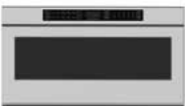
30" Drawer Microwave