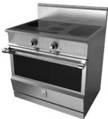
36" Induction Range

Induction cooking has long been lauded as the most efficient way to cook. Now, Hestan delivers chef-worthy culinary power with that incredible efficiency. By transforming your cookware into its own heat source, Hestan’s electro-magnetic elements instantly generate heat with immediately responsive control. So you can sear, simmer and sizzle your way to bigger flavor with a smaller carbon footprint (and a much cooler kitchen).