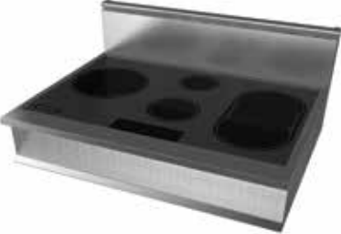
36" Induction Rangetop