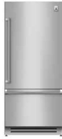
36" Bottom Compressor Refrigerator