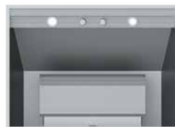
36" Liner Hood Also in 30", 42", 48" and 54" widths

AUTOMATIC DISHWASHER DOOR OPEN The dishwasher door automatically opens at the end of the cycle. This increased airflow significantly optimizes drying and eliminates water spots. It's also a visible reminder that the dishwasher has finished – because at an ultra-quiet 42dB, your ears will never know the difference.