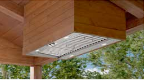
SPRUCE INSERT (AK98) The Spruce 22-1/2" deep outdoor insert can be installed in wall or island applications. Spruce includes corrosion-resistant, 304-grade stainless steel and powerful 1,200-CFM internal blowers to handle the most intense grilling. Features 3-speed metallic knob controls, LumiLight LED lighting, and pro baffle filters. Size: 36", 42", 48", 60" CFM: 1,200