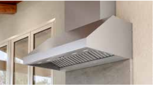
CYPRESS WALL (AK78) Cypress features a seamlessly contoured, welded and polished exterior along with a corrosion-resistant, 304-grade stainless steel canopy that houses high-performance, pro baffle filters. Featuring 3-speed metallic knob controls, LumiLight LED lighting and an extended 32" depth for even more capture. Optional 12" duct cover and telescopic duct cover for 10' to 12' ceilings are available. Size: 36", 42", 48", 54" CFM: 1,200