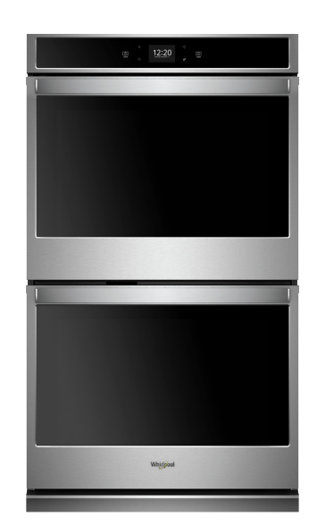
Stainless Steel WOD51EC0HS