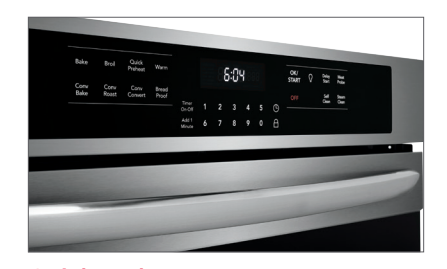
Quick Preheat Preheat in just a few minutes.<sup>1</sup>

Get faster, more even multi-rack baking with a powerful convection fan and third heating element that evenly circulates hot air throughout the oven.