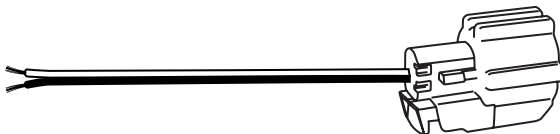
Fig 4 Speaker Extension Cable x2 (Female Plug)