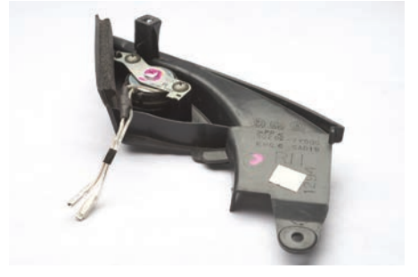
4. Locate the 2-pin tweeter adapter plug and connect it to your new tweeter (Fig 2), making sure the polarity is correct.