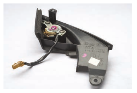
2. Unscrew the factory tweeter from its housing.