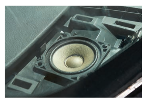
1. Remove factory grill from the vehicle to gain access to the factory tweeter.