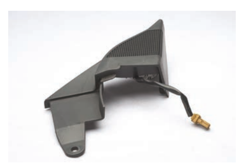
1. Remove door panel or unclip tweeter cover/housing to gain access to the factory tweeter.