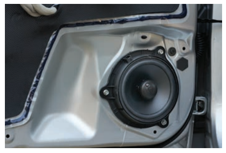
2. To remove the factory speaker, unscrew the 3 x 10mm bolts (do not discard these screws you will need them to install your new speaker)