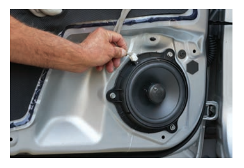
5. Now plug the factory speaker plug into the new speaker. If the factory plug is not long enough try to remove some of the tape on the wire to extend it or use the supplied extension cable (see Fig 4, pg 4). Reinstall door panel.