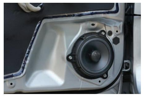
4. Fit new speaker in place and make sure all mounting holes line up. Install with the 3 x 10mm screws you removed from the factory speaker.