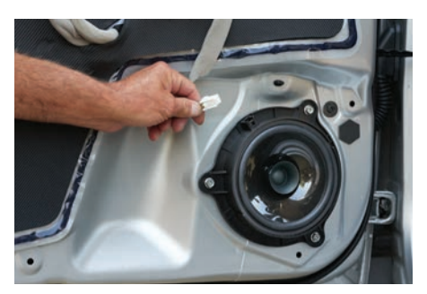
1. After removing the door panel, unplug speaker plug from factory speaker.