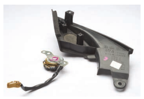
3. Remove factory bracket from tweeter and attach to new tweeter using the same hardware.