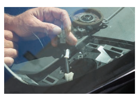
3. Locate both the tweeter adapter plate and the 2-pin tweeter plug adapter mount new tweeter in the adapter and connect the adapter plug (fig 2). Make sure the polarity is correct. Plug your new tweeter into the factory plug.