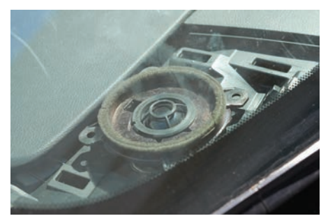
4. Install your new tweeter to the A pillar using the screws you removed from the factory tweeter. Reinstall factory grill.