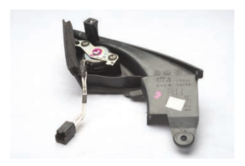
5. Plug your new tweeter into the factory plug and reinstall door panel or tweeter cover/housing.