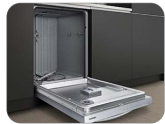
Stainless Steel Interior Door