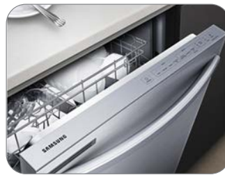
Digital Touch Controls