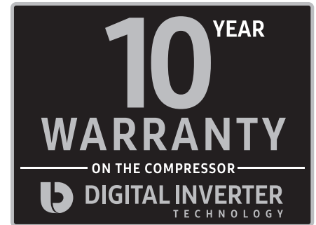
Digital Inverter Compressor