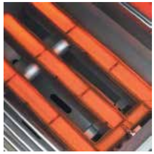
TRIDENT™ INFRARED BURNER

Our unrelenting attention to detail and our passion for innovation have fostered the stunning features that define the Lynx Professional Series. These features begin with meticulous hand-crafted excellence, and they culminate in powerful capabilities that give you precision control.