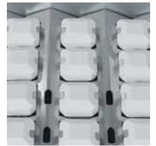
CERAMIC RADIANT BRIQUETTES