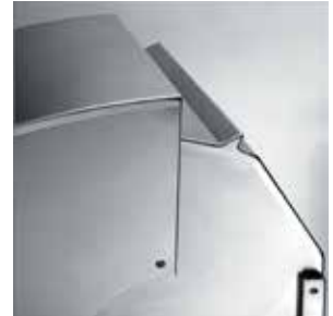
HEAT STABILIZING DESIGN