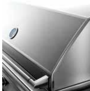
SEAMLESS WELDED CONSTRUCTION