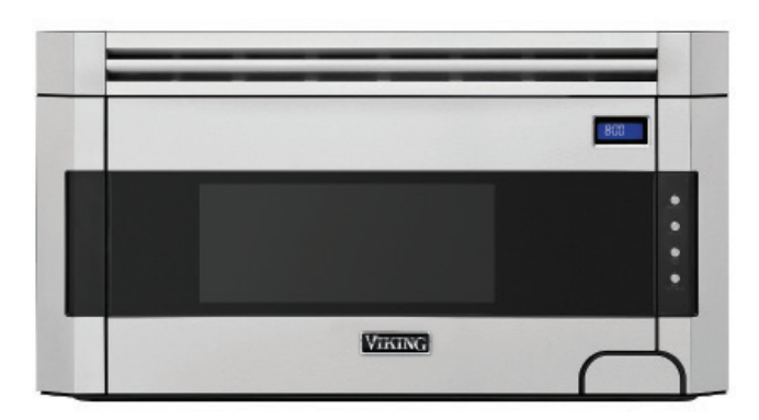
30" Wide Conventional Microwave Hood