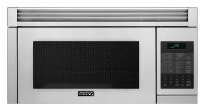
30" Wide Convection Microwave Hood