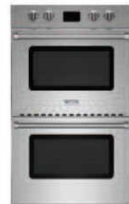
30" Drop Doors