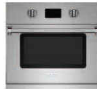
30" Drop Down Door