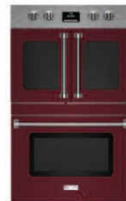
30" French Doors