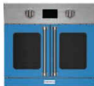
30" French Doors

Features a built-in artisan baking stone with precise temperature control, touch screen control panel with 12 cooking modes (including StoneBake™, True European Convection & Sabbath), Infrared Broiler, eco-friendly Continu Clean™ and an extra-large cavity that fits a commercial size baking sheet.