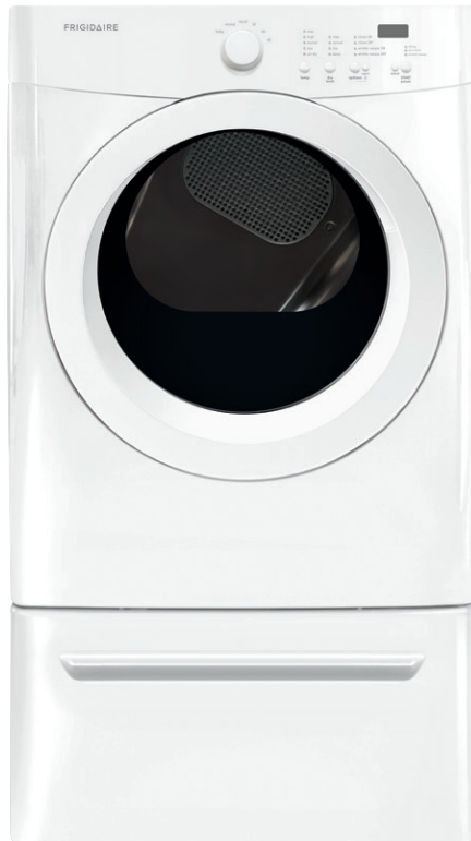
Optional SpaceWise® Pedestal Drawer Shown