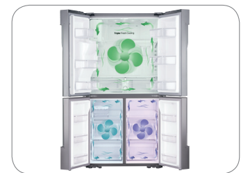
Triple Cooling System