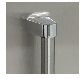
Optional Professional Handle