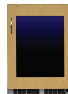
Framed Overlay (Panel Ready)*