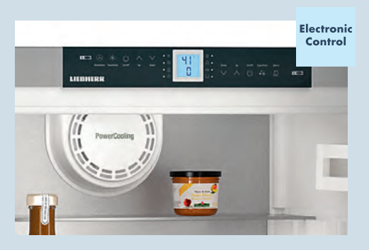
Electronic Display: Our intuitive electronic touch control panel ensures all functions are easy and convenient to use as well as guarantees that the settings selected remain accurate and constant.