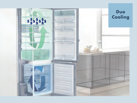
DuoCooling: The dual refrigeration system creates optimal conditions in both the refrigerator and freezer which lengthens the shelf life of food items for a healthier lifestyle. This technology also preserves the flavor and texture of foods since there is no transfer of unwanted air. moisture or food aroma between the two compartments.