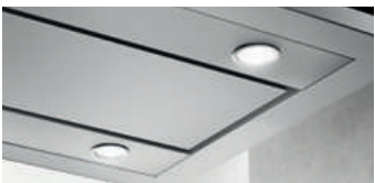
LED Light with Dimmer & Perimeter Aspiration