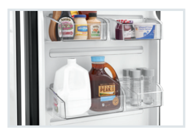
Custom-Flex<sup>™</sup> Door Bins & Accessories

The Custom-Flex™ Door comes with 4 different bins and accessories so you can customize your door. It includes one Large, two Medium and one Small Bin.