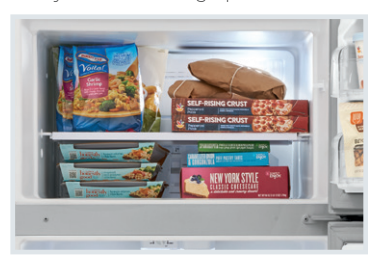
Full-Width Glass Freezer Shelf Organize items in your freezer better so you can find foods quickly and easily clean up spills.