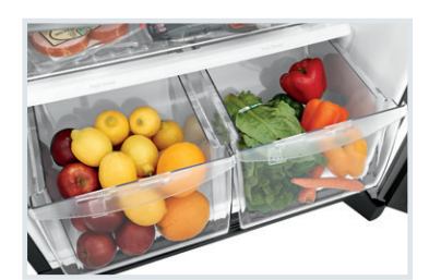
Humidity-Controlled Crisper Drawers Our humidity-controlled crisper drawers are designed to keep your fruits and vegetables fresh so you don't have to worry about stocking up.

The Custom-Flex™ Door comes with 4 different bins and accessories so you can customize your door. It includes one Large, two Medium and one Small Bin.