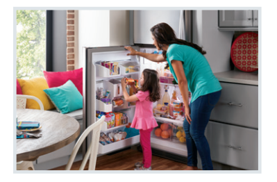
Over 100 Ways to Organize Our SpaceWise® Organization System offers 100 ways to organize with the Custom-Flex™ Door