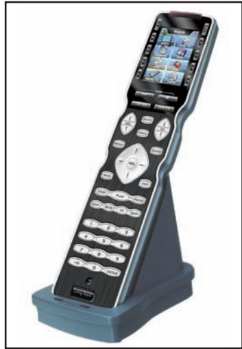
The MX-980 on it's Charger.

The Status light should immediately light. Red indicates that it is charging. Blue shows that it is fully charged. There is no harm in leaving the MX-980 on its charging base whenever it is not in use. The Lithium Ion battery cannot be overcharged.