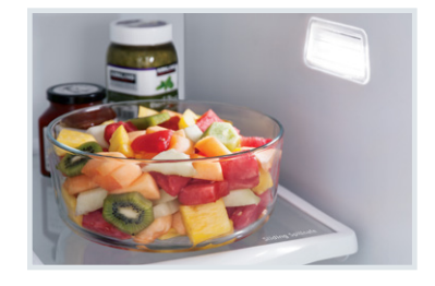
Bright LED Lighting Find food faster with bright LED lighting.

Our SpaceWise® Organization System offers 100 ways to organize with the Custom-Flex™ Door and the Store-More™ Slide-Under, Flip-Up Shelf.¹