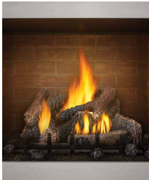
The Riverside™ 42 Clean Face shown with decorative sandstone brick panels