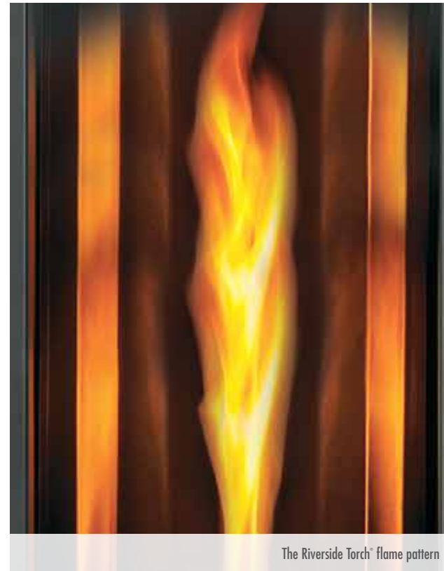
The Riverside Torch® flame pattern

Riverside Torch® - GSST8 6,000 BTU's 49 11/16"h x 15"w x 7 5/16"d Natural gas or propane