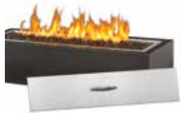
Brushed Stainless Steel Cover* and Hammertone Pewter Cabinet (included)