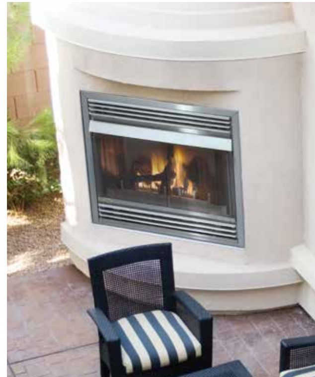
The Riverside™ 36 shown with standard brushed stainless steel upper and lower louvers