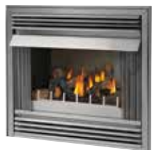
Safety Screen Brushed Stainless Steel (included)