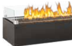
Glass Wind Deflector (optional)

* Cover is not for use with optional rock media kits.