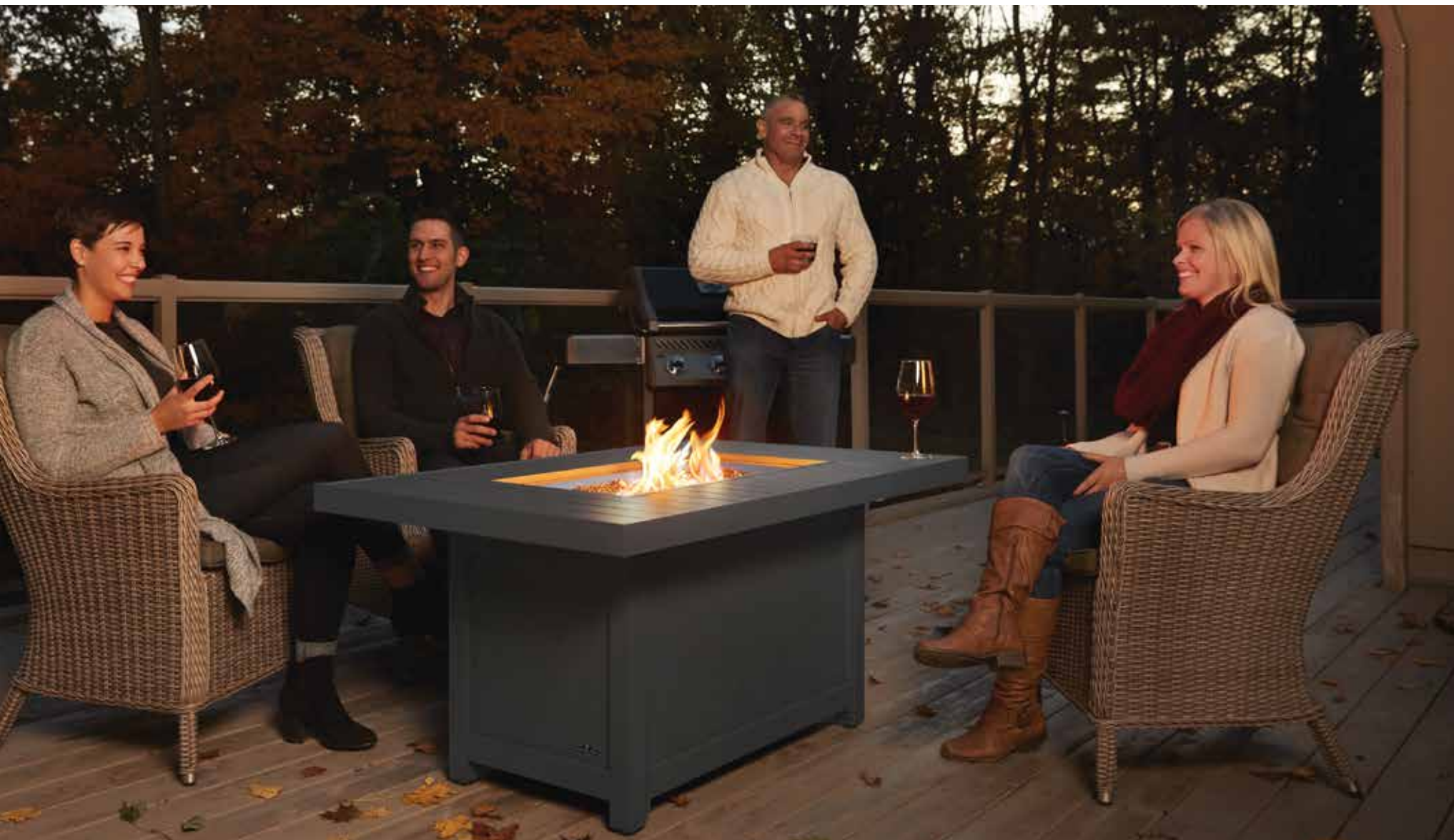
The Hamptons Rectangle Patioflame® Table