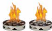
Optional River Rock Media Kits Multi-Colored or Grey Finishes