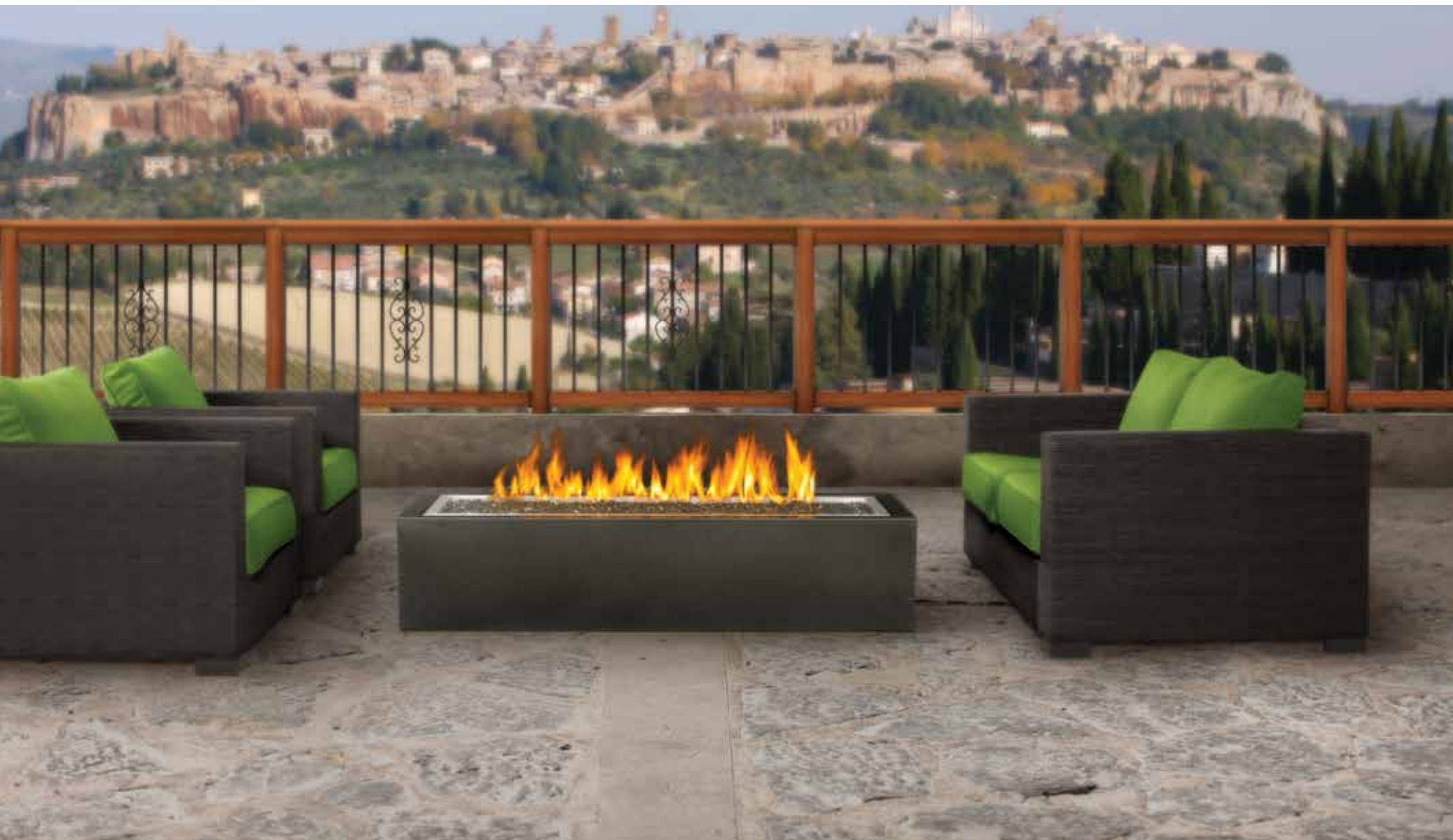
The Linear Patioflame® shown with standard Topaz CRYSTALINE® ember bed