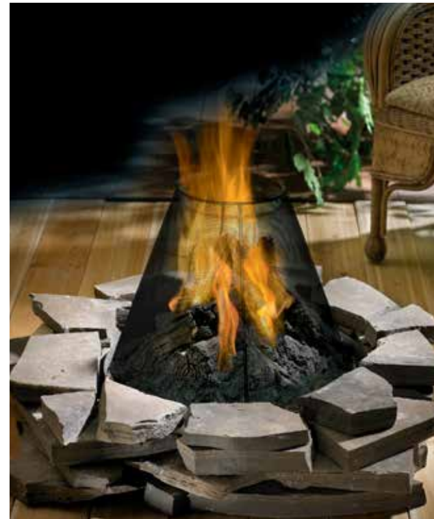
The Gas Patioflame® shown with GLOCAST® Log Set (GPF) and optional safety screen