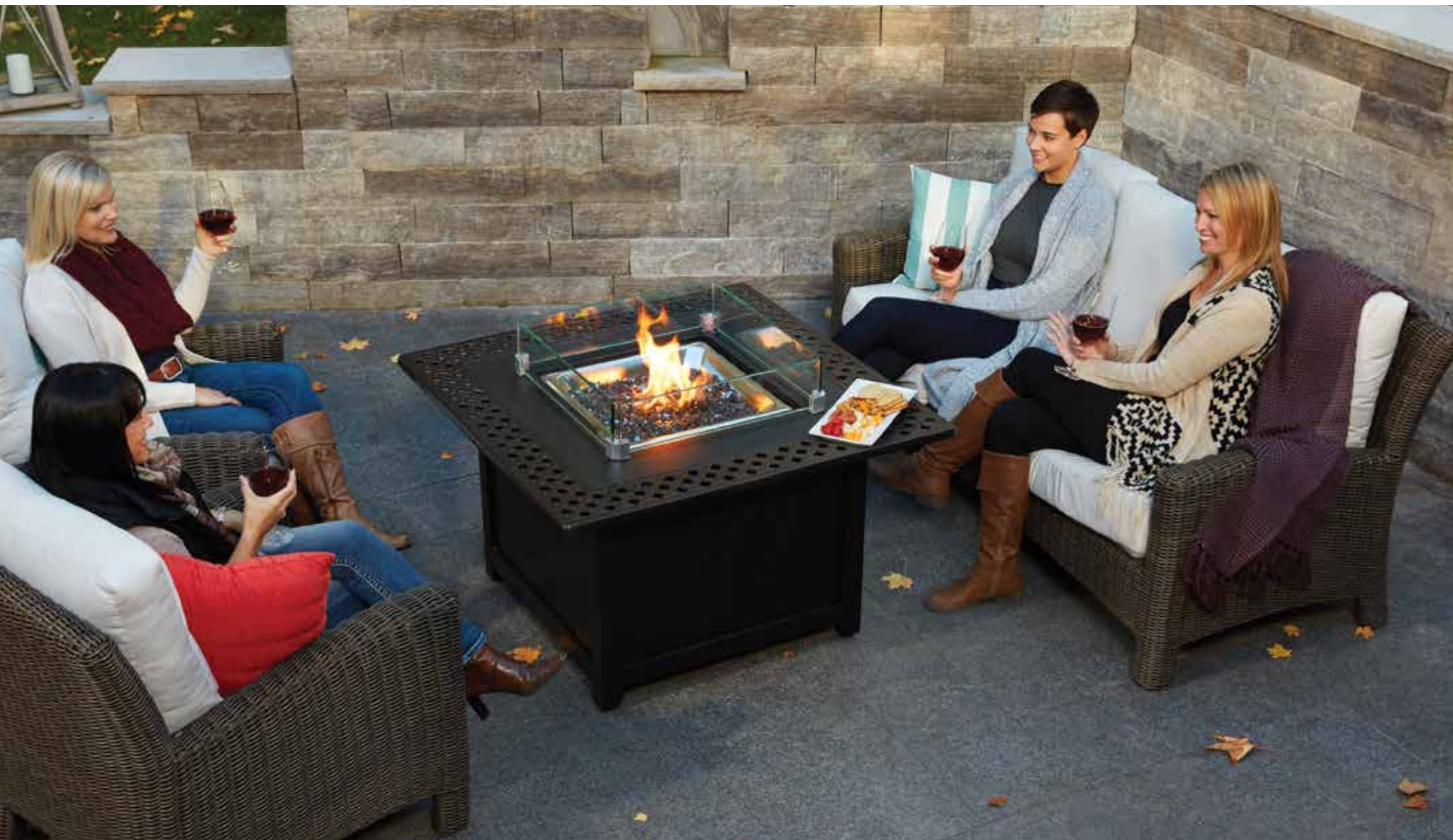
The Kensington Square Patioflame® Table