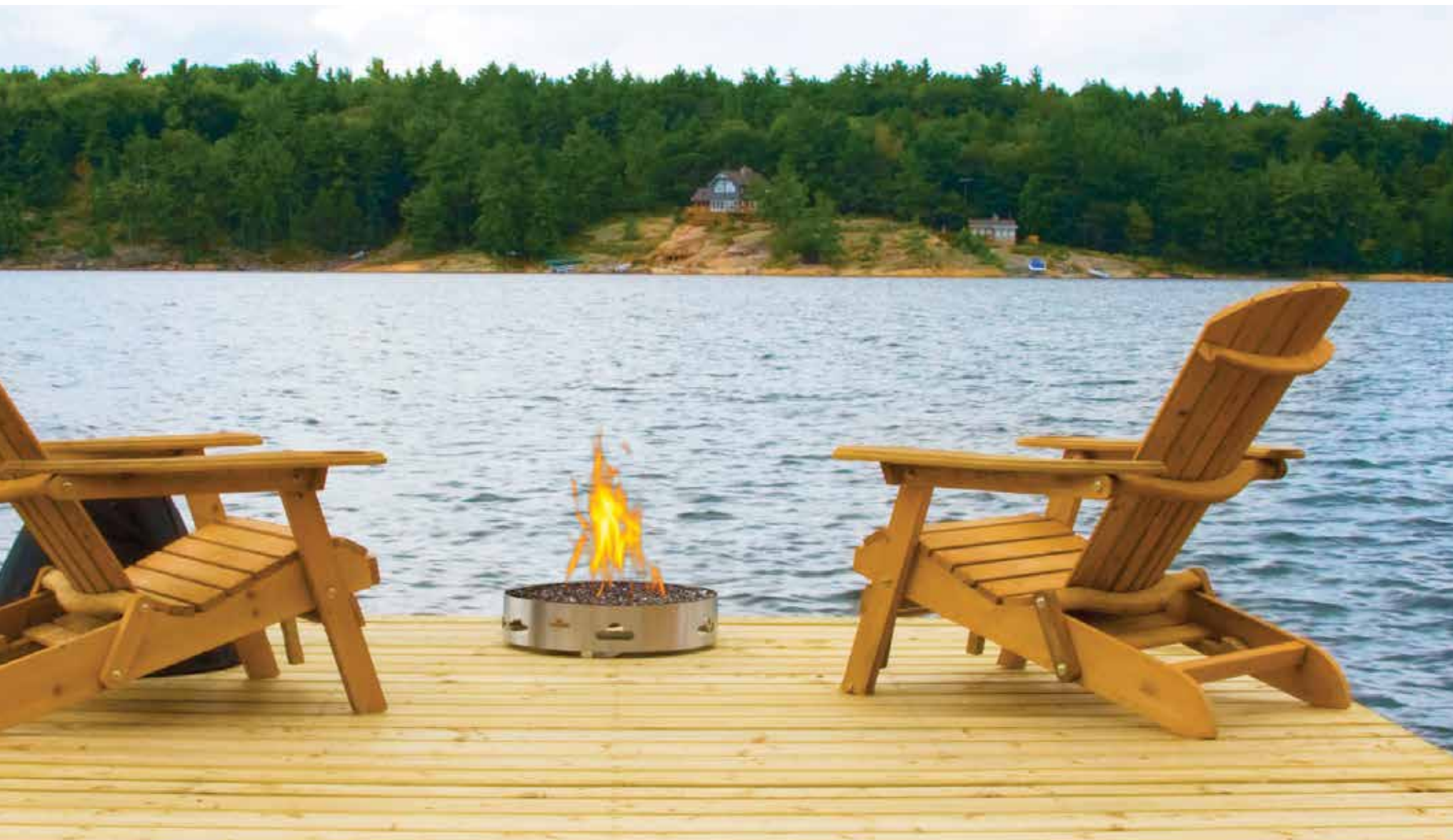
The Gas Patioflame® shown with Topaz CRYSTALINE™ Ember Bed (GPFG)