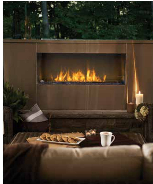
The Galaxy™ shown in a custom built-in stainless steel application