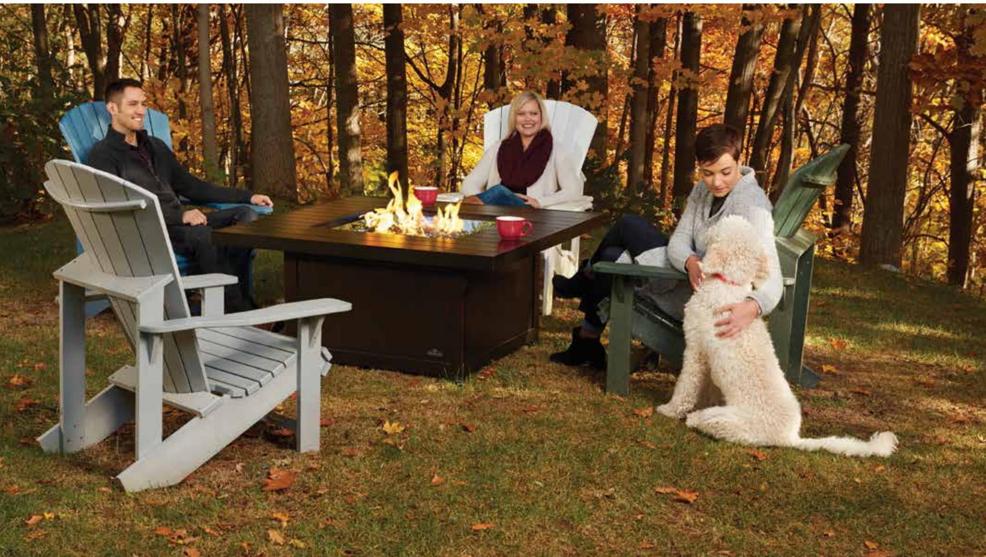
The St. Tropez Square Patioflame® Table