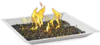
Square Burner Kit - GPFS