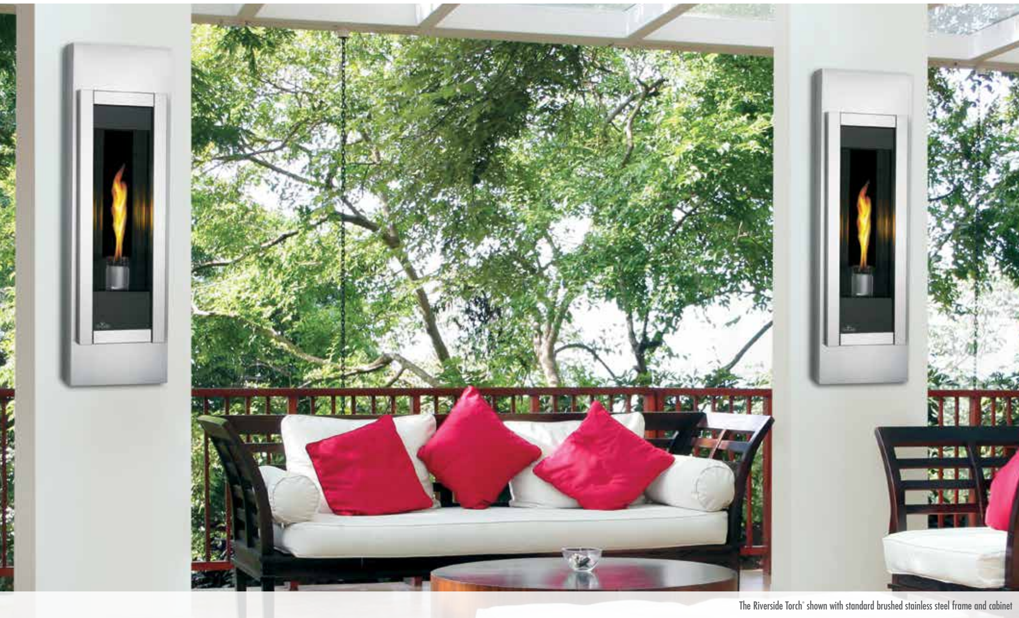
The Riverside Torch ® shown with standard brushed stainless steel frame and cabinet