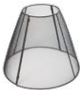
Safety Screen (optional)