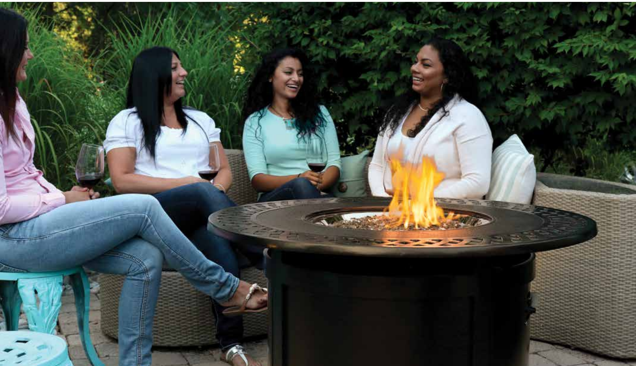
The Victorian Round Patioflame® Table