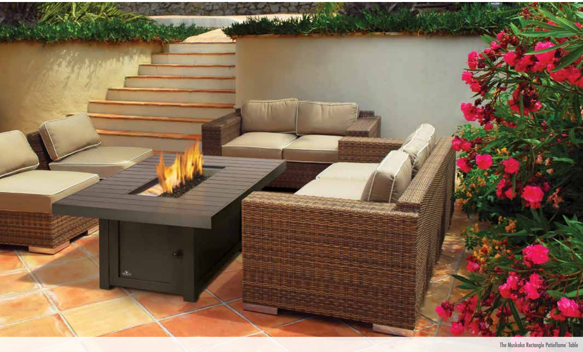
The Muskoka Rectangle Patioflame® Table