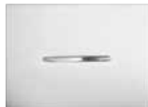
Fireplace Cover Brushed Stainless Steel (included)