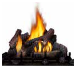
PHAZER® log set and embers (Included)