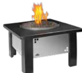
Table and Black Granite Top (optional)