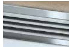
Upper/Lower Louvers Brushed Stainless Steel (included)