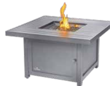
Square - Grey