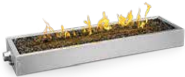
Linear Burner Kit - GPFL48

Consult your owner's manual for complete and up-to-date measurements and installation instructions for proper clearances to combustible materials.