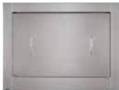
Seasonal Protective Cover (Optional)