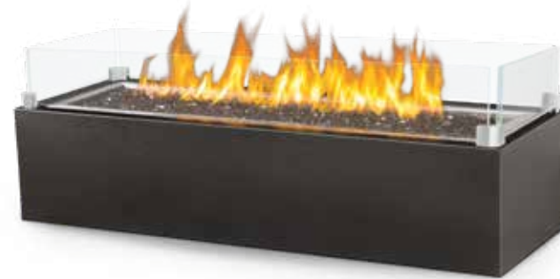
The Linear Patioflame® shown with standard Topaz CRYSTALINE™ ember bed and windscreen