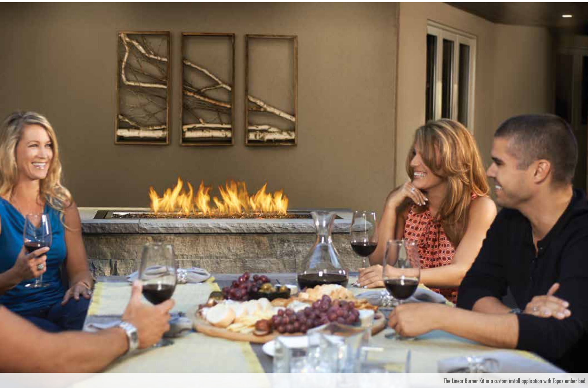
The Linear Burner Kit in a custom install application with Topaz ember bed