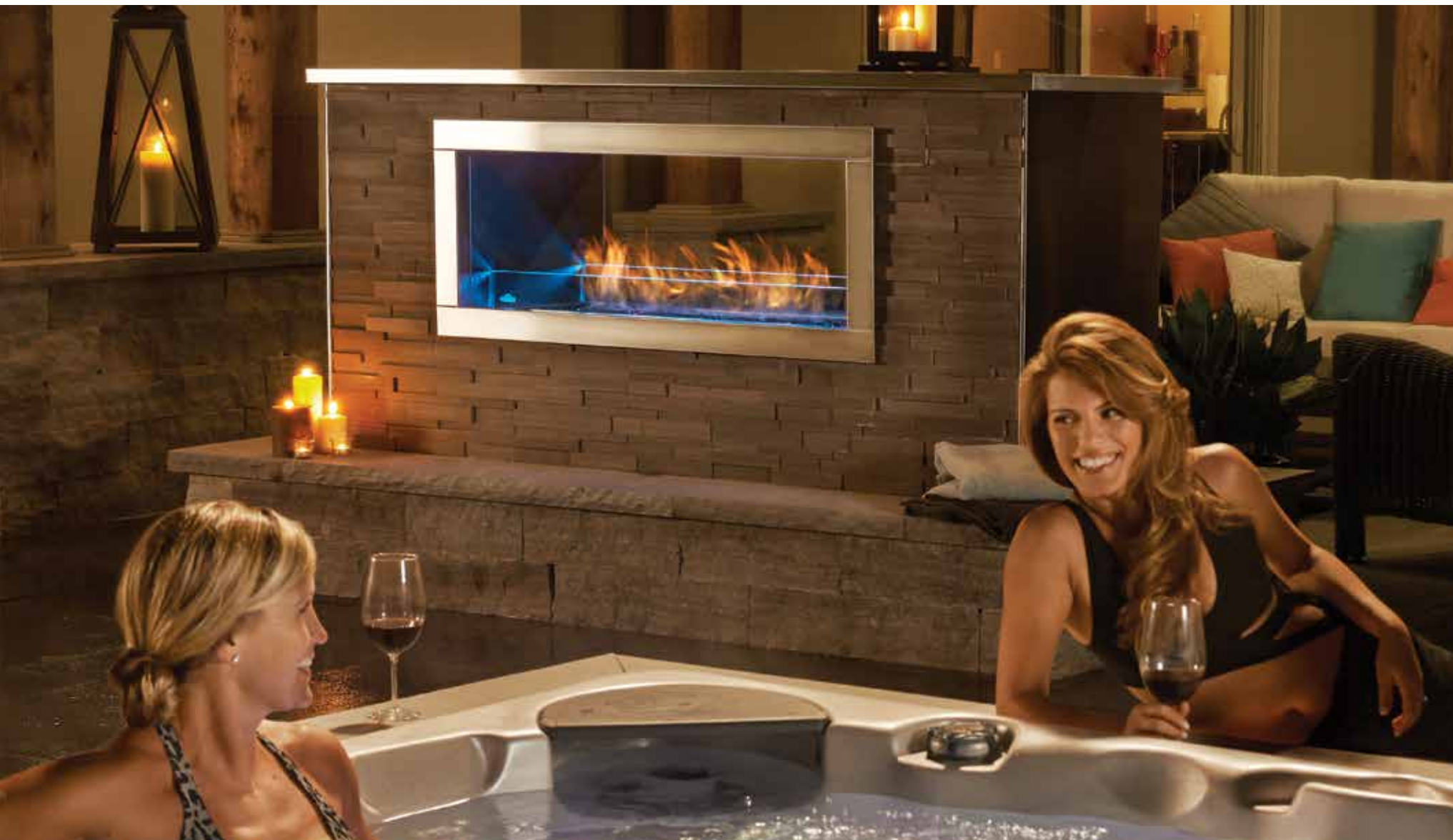
The Galaxy™ See Thru shown with optional four-sided trim kit and accent light set on blue