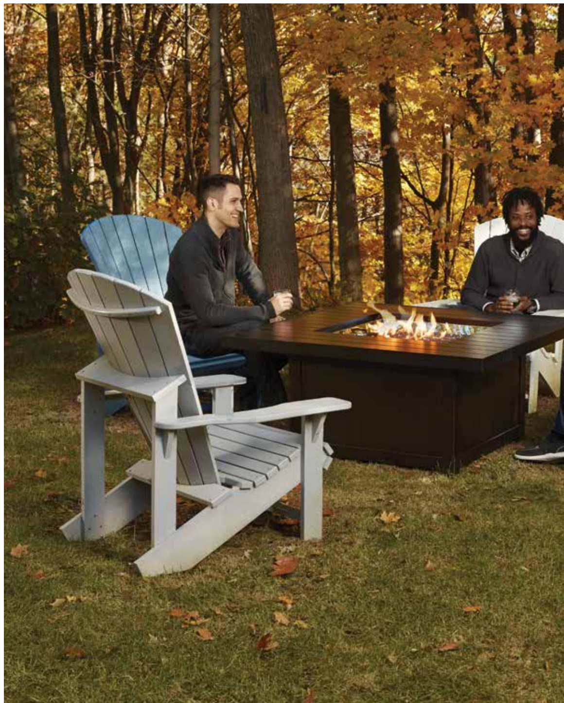
The St. Tropez Square Patioflame® Tables