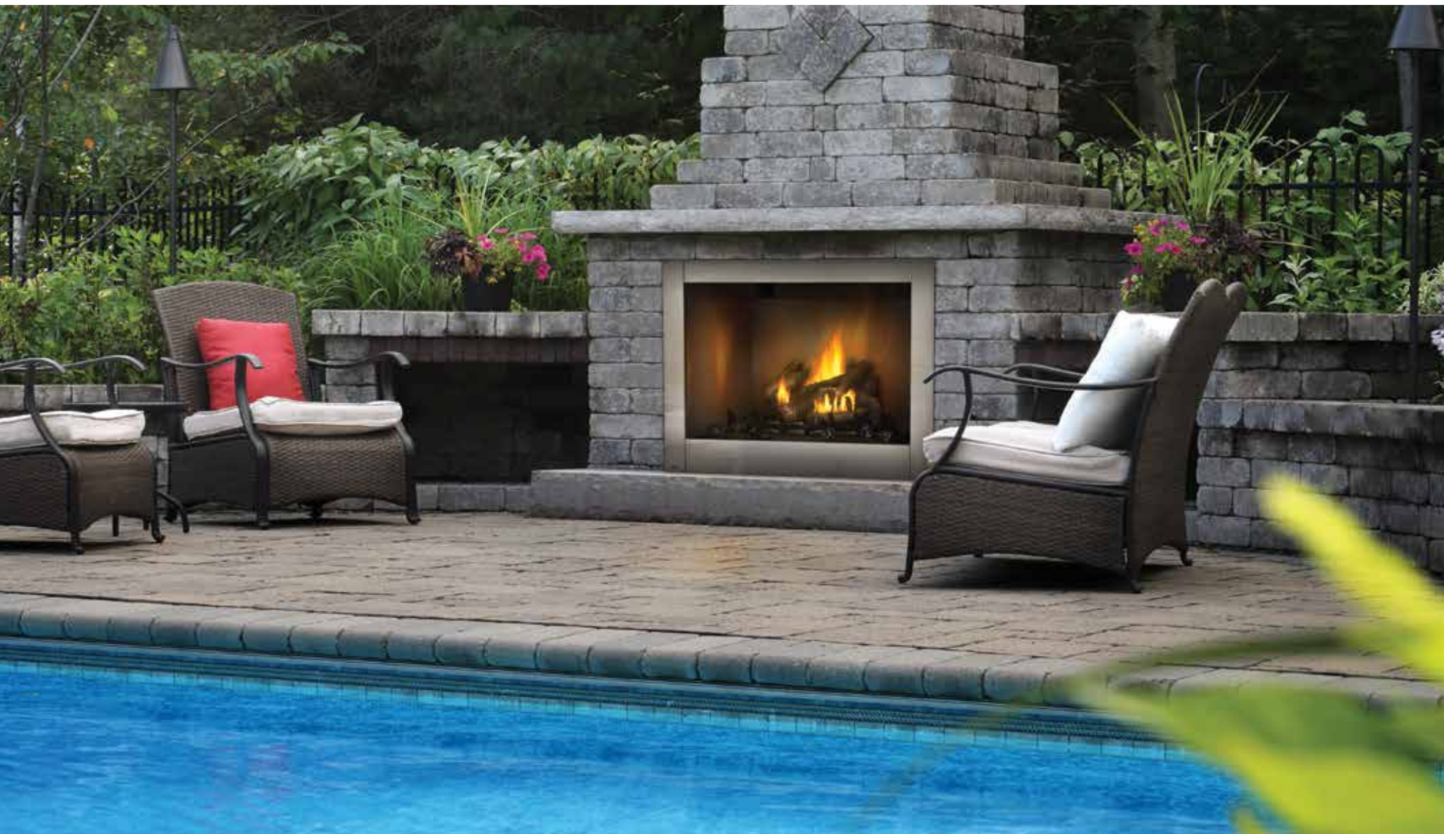
The Riverside™ 42 Clean Face