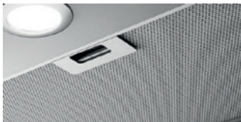
Anodized Aluminum Mesh Filters

The slim Allasio with 4 ¾" height is ideal where under-cabinet space is limited, plus the contemporary styling and gleaming colors will compliment other appliances and most cabinetry. Allasio features a 3-speed, 300 CFM internal blower, which provides sufficient ventilating power for most kitchens. The attractive, backlit push button controls illuminate an elegant blue glow when activated and allows the user to manage blower speeds and dual LED lamps.