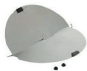
Optional Back Draft Damper, 7" Round CODE: KIT02723 MODEL: EXXNRVRD