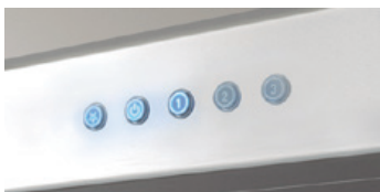
backlit electronic push button controls