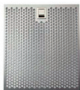
Optional Stainless Steel Mesh Grease Filter CODE: KIT02591 / MODEL: EBLGFK30 (30") CODE: KIT02592 / MODEL: EBLGFK36 (36")