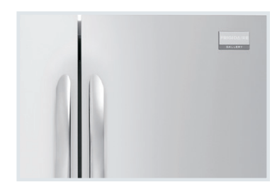
Smudge-Proof™ Stainless Steel<sup>2</sup> Reduces fingerprints and smudges so

Easily make room for tall or large items with the new Flip-Up and Slide-Under Shelves