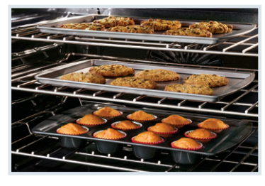
True Convection Single convection fan circulates hot air throughout the oven for faster and more even multi-rack baking.