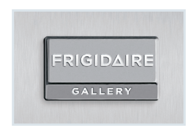
Smudge-Proof™ Stainless Steel Reduces fingerprints and smudges so it's easy to clean.