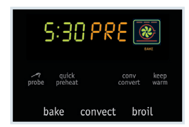
Quick Preheat Preheat in just a few minutes.<sup>1</sup>