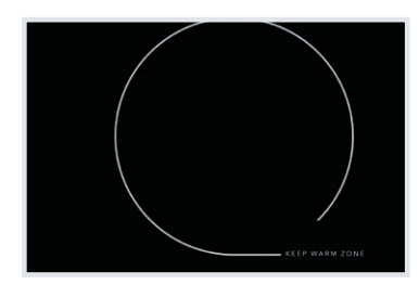
Keep Warm Zone Consistently keep dishes warm while the rest finish for delicous results, every day.