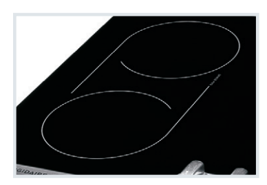
SpacePro™ Bridge Element 2-in-1 cooktop element offers endless meal options. Cook two separate dishes at once, or combine two elements into one for large pots or griddle use.