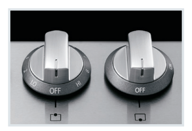
PrecisionPro Controls™ Prepare a range of dishes with precision, whether you're simmering, sautéing, searing or boiling.