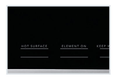
Indicator Lights Informs you when the surface is hot.