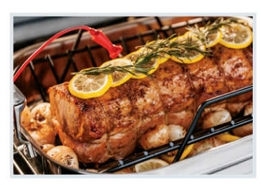
PowerPlus® Temperature Probe Ensures great results the first time. Set and monitor dish temperature with the PowerPlus® Temperature