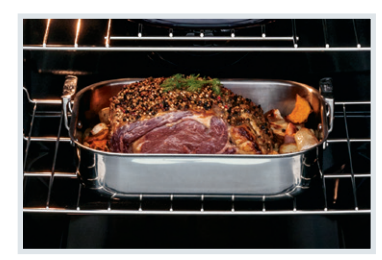
PowerPlus® Convection Powerful performance delivers consistent results. Evenly cooked dishes, every time, with PowerPlus® Dual-Fan Convection Bake and Roast.