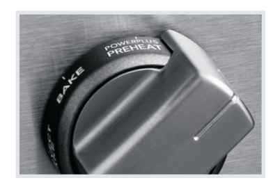
PowerPlus® Preheat With PowerPlus® Preheat, your oven is ready in a few minutes for a powerful start to every delicious meal.