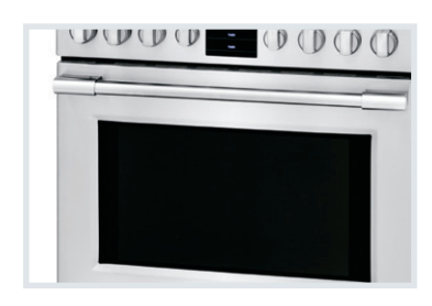
Smudge-Proof™ Resists fingerprints and cleans easily.