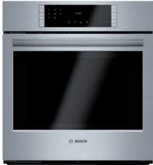
HBN8451UC Stainless Steel

The Bosch wall oven installs flush and features a QuietClose™ door.