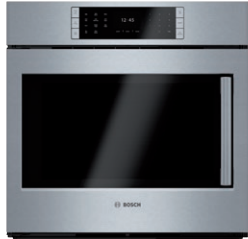
HBLP451LUC Stainless Steel

The Bosch wall oven features a SideOpening door for easier cavity access and a high-resolution TFT user interface.