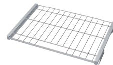
HEZTR301 30" Telescopic Rack