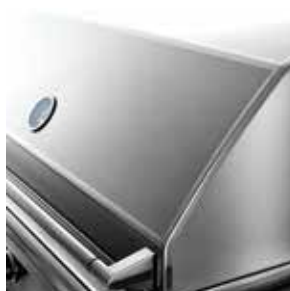
SEAMLESS WELDED CONSTRUCTION