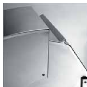
HEAT STABILIZING DESIGN