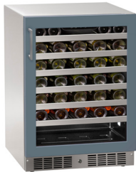
MRWC224-IG31A Panel Ready Frame Glass