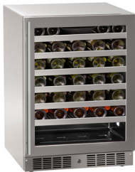
MRWC224-SG31A Stainless Steel Frame Glass