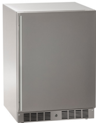
MRRE224-SG31A Stainless Steel Solid