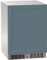
MRRE224-IS31A Panel Ready Solid