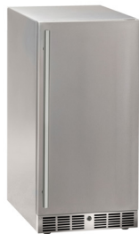
MRRE215-SS31A Stainless Steel Solid