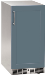
MRRE215-IS31A Panel Ready Solid