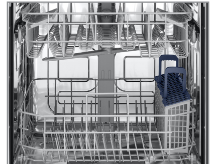
Stainless Steel Interior