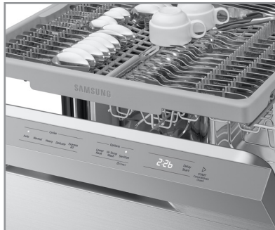
Digital Touch Controls