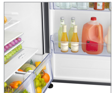
Extra-Large Flexible Storage