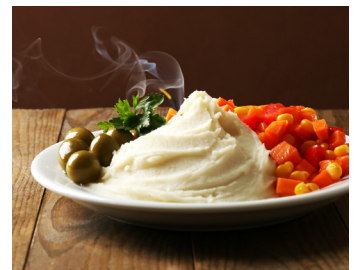
14.1 in. Carousel® Turntable for Even Cooking