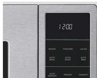
Premium White LED Display is Easy to Read