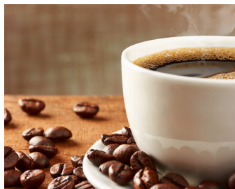
Express Cook for Single Touch Cooking for Up-To 6 Minutes