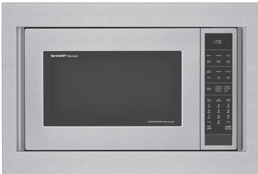
SMC1585KS Convection Microwave Oven with the RK94S30F Trim Kit

With innovative features like Auto Broil, Auto Roast, Auto Bake, Auto Defrost and the Carousel® turntable system, reheating your favourite foods, snacks and beverages is easy. With decades of experience designing smart, innovative microwaves, it's easy to see why cooks throughout the world trust Sharp Carousel.