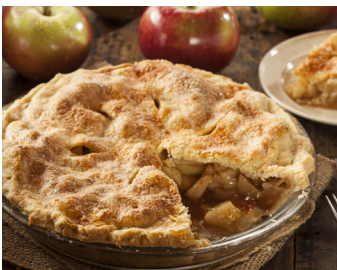
Utilize Low Mix or High Mix to Incorporate Both Convection Heat and Microwave Cooking

With decades of experience designing innovative cooking appliances, it's easy to see why home cooks throughout the world trust Sharp Carousel.