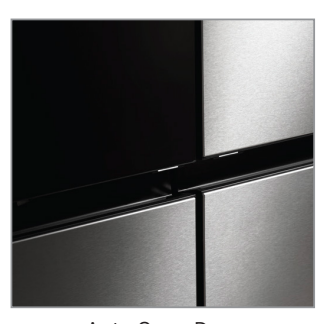
Auto Open Door