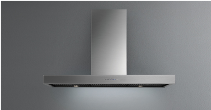
Photograph is for information purposes only May not correspond to the selected version