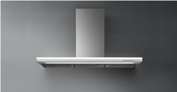
Photograph is for information purposes only May not correspond to the selected version